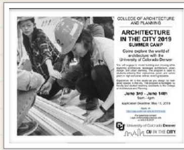
CU DENVER ARCHITECTURE SUMMER CAMP FOR HIGH SCHOOL STUDENTS