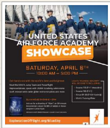
UNITED STATES AIR FORCE ACADEMY